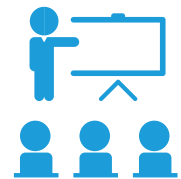
Lesson plans and stimulus

If you know anyone who might be able to make quality RSE happen in their school, why not share this flyer with them? Let's make great RSE happen with DO...!