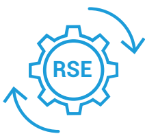
Resources to optimise RSE

Visit www.dorseforschools.com to explore the resources we offer: